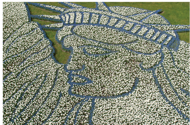
Statue of Liberty in blossoming