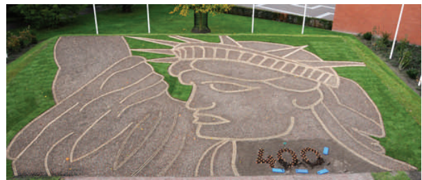
Statue of Liberty before blossoming.

The 506th Infantry Regiment of the 101st Airborne Division has returned home from Afghanistan a few months ago where, in splendid co-operation, they worked side by side with our own Dutch young men and women.