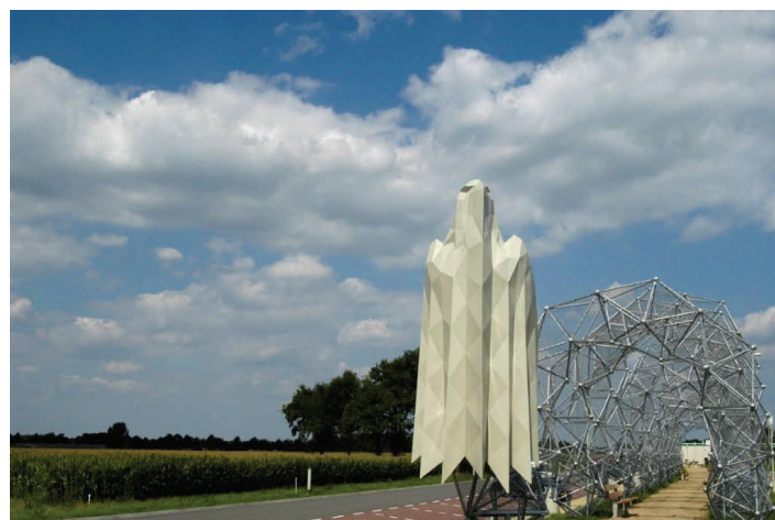
Left the former dropzones between Best en Son, right the monument with one of the eagles.

Their arguments were honored and a new design, with 2 beautiful eagles and a 30 meter long framework reminding the visitor of parachutes which catch wind on landing, proudly stands on the edge of the former drop zone Son.