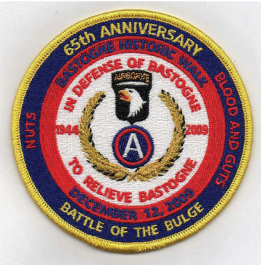
The patch walkers of the Historical Walk earn by participating.

Numerous activities were taking place. On Saturday morning there was the 32nd Bastogne Historic Walk which, this year, was focused on the meeting between the American 101st Airborne Division and Patton's 3rd Army. Despite the cold, between 4000 and 5000 walkers attended!